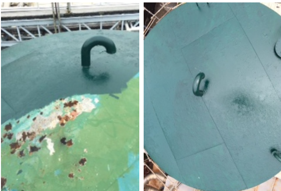
Ceramic Brushable Green coated onto the tank to provide a surface resistant to corrosion and abrasion