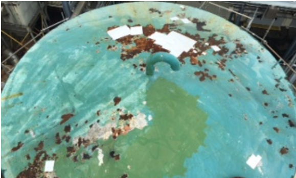
E190 Brushable Epoxy was coated onto Fibreglass Tape to patch repair the cracks in the tank