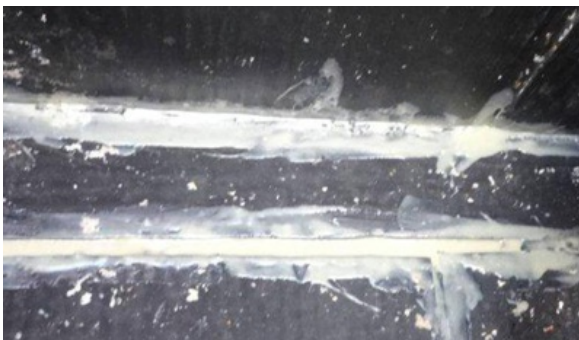
Once cured, AB formed a waterproof material sealing every gap and protecting the concrete lining beneath