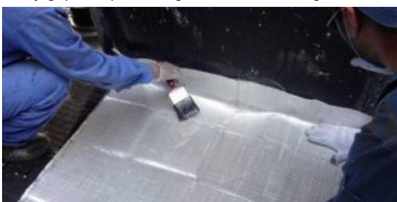
Fibreglass sheets were layered over the matting and coated with an epoxy resin to create a new reinforced floor surface