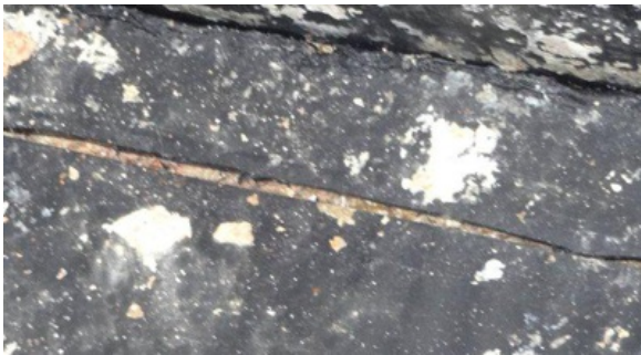
Gaps had appeared in the rubber matting, exposing the concrete lining of the tank to seawater

The floor of a seawater storage tank undergoes repair after gaps appeared between rubber matting, leaving the concrete coating below exposed