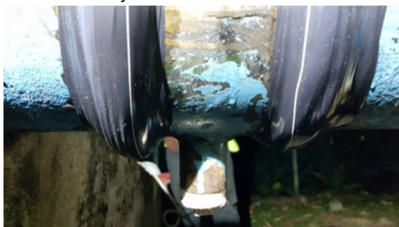
Once the ends of the joint had been encapsulated, Wrap & Seal was applied directly over the leak area to create a ridge increasing the pressure resistance of the repair