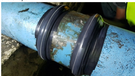
Wrap & Seal was applied to both ends of the saddle joint, successfully sealing the pipe