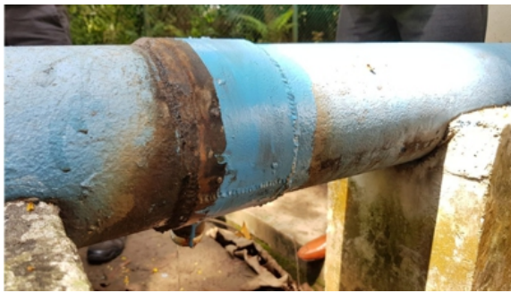
Water was seeping from both ends of the saddle joint, one of which was suffering from heavy corrosion

A 150mm steel pipe connected to a pumping house leaking from both ends of a welded saddle joint is sealed in a repair built up and over a 20mm step