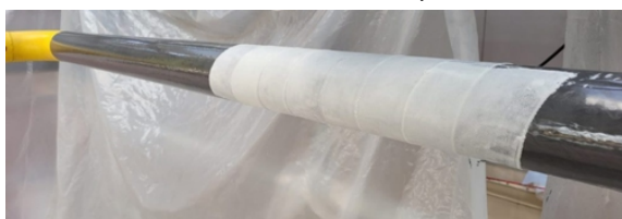
SylWrap HD increased the thickness of the weakened area where the pipe had contact with the U-support