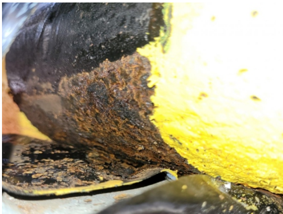
The pipe was heavily corroded where water had been trapped between a protective PVC tape and the line

An industrial plant refurbish and repair a three metre section of corroded steel pipe hung from a ceiling and carrying natural gas as part of a CHP system