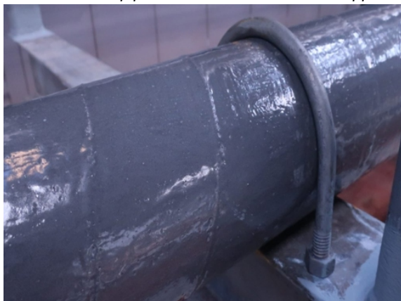
A second Liquid Metal coating was applied over the SylWrap and the pipe fixed to the U-support