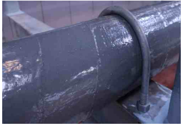
A second Liquid Metal coating was applied over the SylWrap and the pipe fixed to the U-support