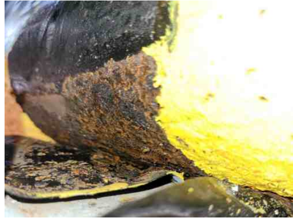
The pipe was heavily corroded where water had been trapped between a protective PVC tape and the line

An industrial plant refurbish and repair a three metre section of corroded steel pipe hung from a ceiling and carrying natural gas as part of a CHP system