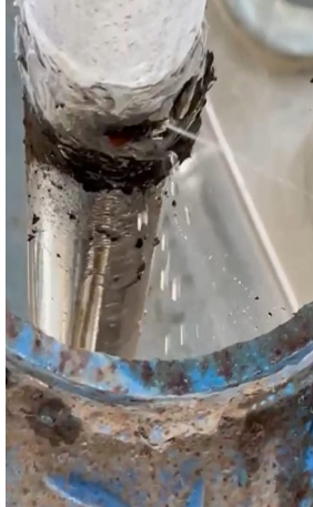
Alcohol juice was spraying through a pinhole leak at a pointed where the line passed through a circular hole in the upper floor of a platform