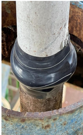
Wrap & Seal Pipe Burst Tape sealed the live leak despite the space constraints around the pipe