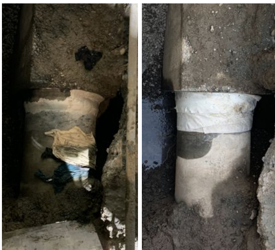
Once water loss had been reduced to an acceptable level by encompassing the leak area, the repair was reinforced with SylWrap Bandage