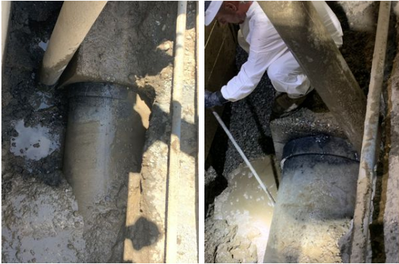
The break was somewhere beneath the joint in the pipe at the point it passed into the concrete wall

A city authority in Canada reduce a significant 2 bar leak down to a slow drip by repairing a break in an underground 600mm concrete water main pipe